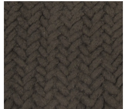
Detail of RS Herringbone Stitch Pattern sole.