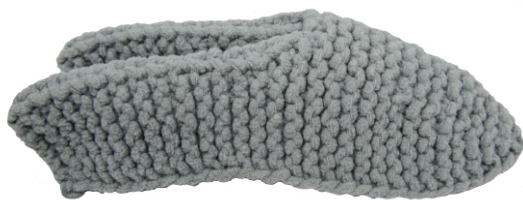
Finished slipper top without sole attached. Ankle flaps are folded in.

You should now have the Right Side Slipper sts on a holder and the Left Side Slipper sts on left hand needle. Using this needle, transfer sts from holder onto needle making sure the RS is facing. You will now have a total of 20 (20,22,22,24)sts on one needle.